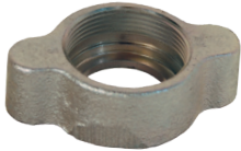
Plated iron / steel