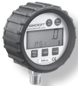
Air Fittings general purpose digital gauge

Visit dixonvalve.com to order your copy of the 2012 Dixon Price List. Dixon: The Right Connection for quality, service and innovation.